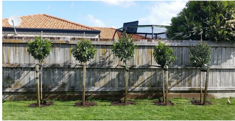
Pleached hedge of Portuguese Laurel