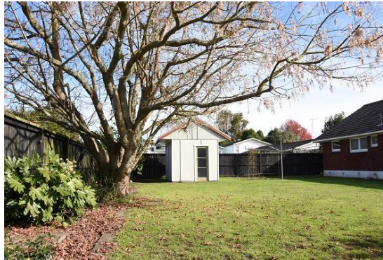
Liquidambar Styraciflua Gumball

Healthy mature trees add an average of 10% to a property's value