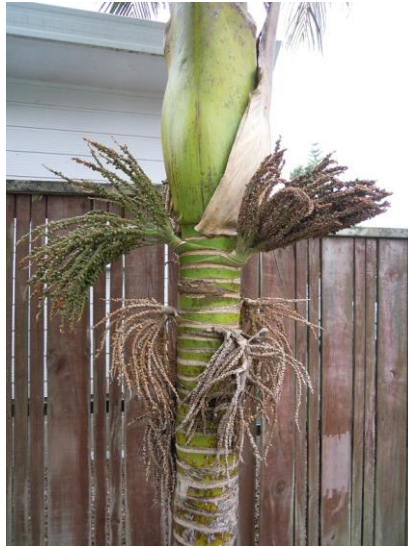
Feature - Nikau palm